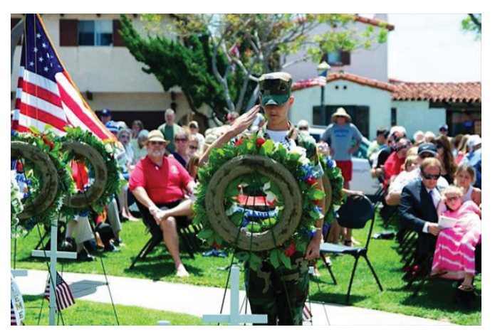
Young Marine Observe Memorial Day in San Clemente

Young Marines Program. The Mission of the Young Marines Program, which includes boys and girls ages 8 through high school, is to positively impact America's future by providing quality youth development. Monies given to this group were used to help defray the costs of various outings, transportation costs, and meals.