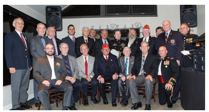
Cannons 240th Marine Corps Birthday Dinner Celebration

THE MARINE CORPS LEAGUE-SOUTH COAST DETACHMENT "BAND OF BROTHERS"